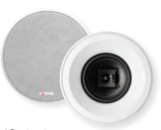
HSi 270 2-Way 6½"In-Ceiling Speaker